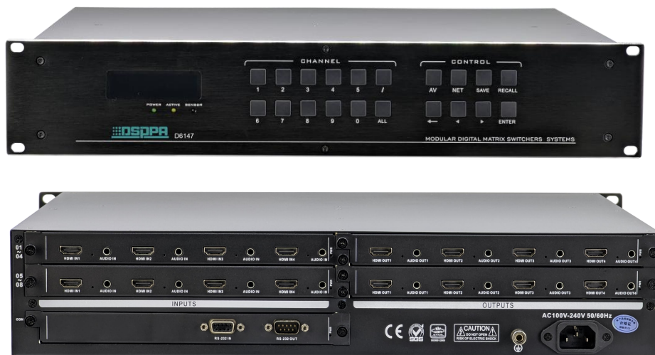
D6151-R60 4-Channel 4K 60 HDMI Input Card